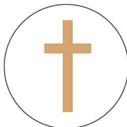
2 Corinthians 5:17