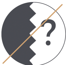
2 Corinthians 4:4